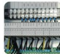
LIMAX Absolute Sensor توصيل مسبق للأسلاك سقف المقصورة