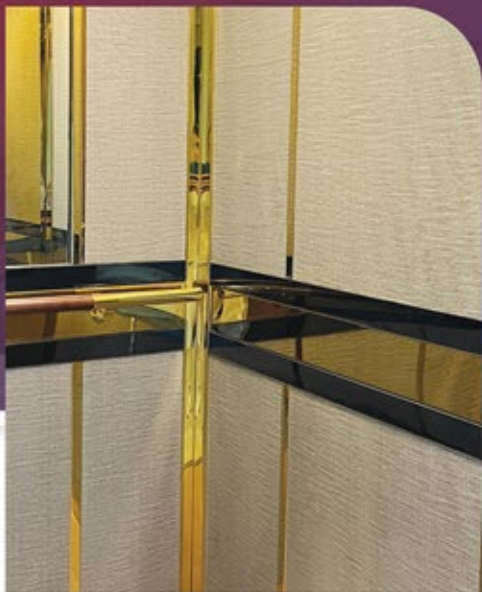
CODE: TE 20.11.02