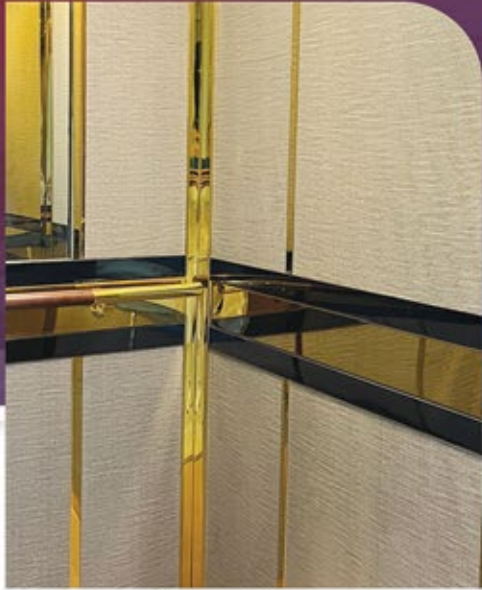
CODE: TE 20.11.02