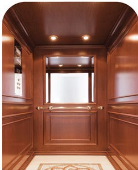
CODE: 2029 H