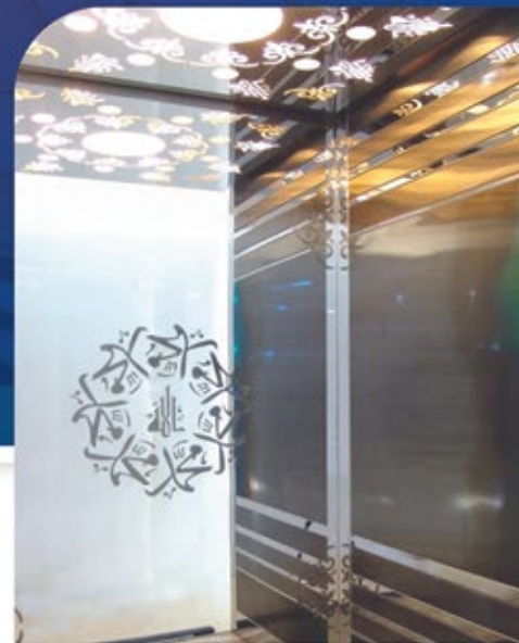
CODE: TE 1815 N