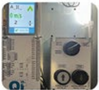
Touch Screen Tool شاشة تعمل باللمس