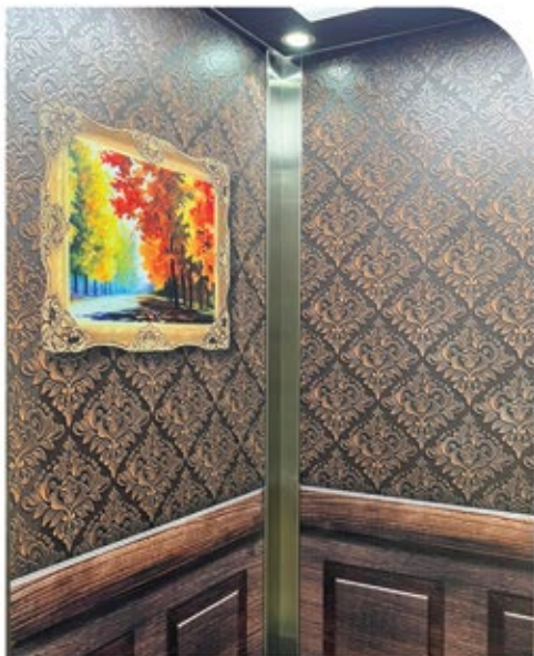
CODE: TE 23.10.16