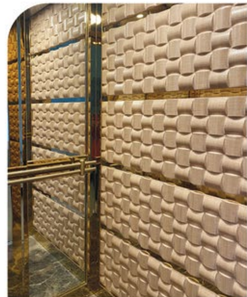
CODE: TE 20.11.01