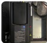
Drive VVVF Fuji 2 or S0320