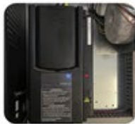
Drive VVVF Fuji 2 or S0320