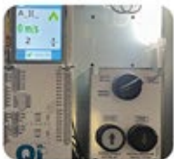
Touch Screen Tool شاشة تعمل باللمس