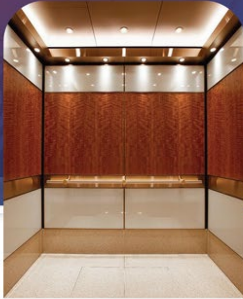
CODE: TE - 156 C