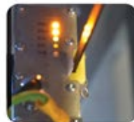
LIMAX Absolute Sensor مستشعر مطلق