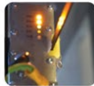
LIMAX Absolute Sensor مستشعر مطلق