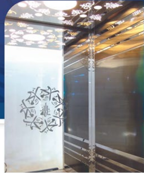
CODE: TE 1815 N